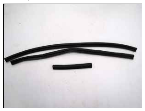
14. Cut the provided edge trim into three sections of 9", 30" and 33"