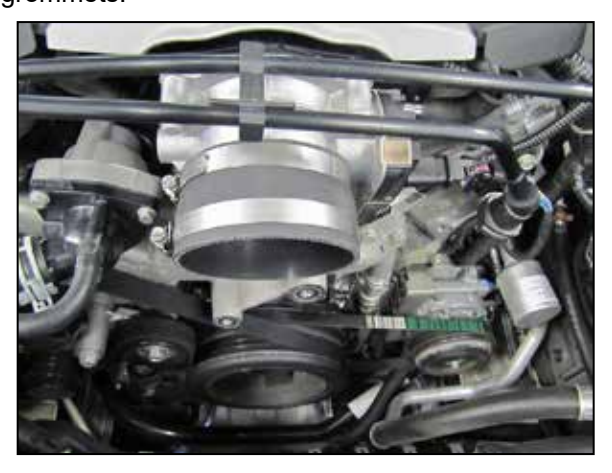
18. Install the provided coupler (08761) onto the throttle body and secure with the provided hose clamps.