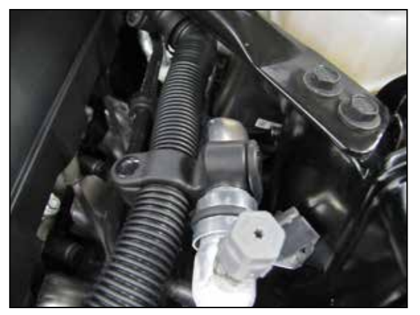
8. Disconnect the sound tube from the A/C line.