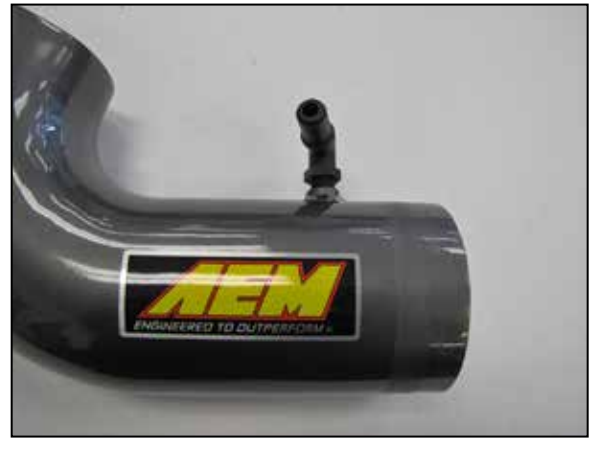
20. Install the 90^{\text{o}} vent fitting into the AEM ^{\!\! 8} intake tube as shown.

NOTE: Plastic NPT fittings are easy to cross thread. Install the vent fitting "hand" tight, then turn it two complete turns with a wrench.