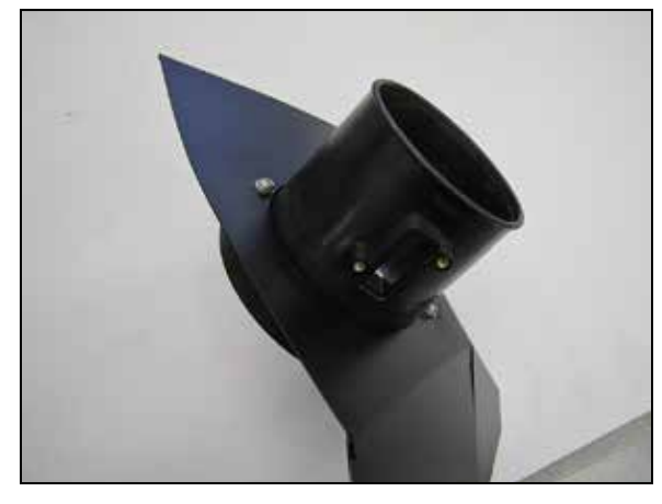
13. Install the provided mass air sensor housing into the provided heat shield and secure with the hardware provided.

NOTE: AEM recommends that customers do not discard factory air intake.