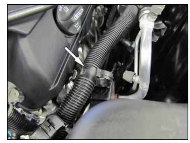
7. Open the clamp that secures the sound tube to the factory air filter housing.