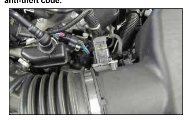
2. Disconnect the mass air sensor electrical connection.

NOTE: Disconnecting the negative battery cable erases pre-programmed electronic memories Write down all memory settings before disconnecting the negative battery cable. Some radios will require an anti-theft code to be entered after the battery is reconnected. The anti-theft code is typically supplied with your owner's manual. In the event your vehicles anti-theft code cannot be recovered, contact an authorized dealership to obtain your vehicles anti-theft code.