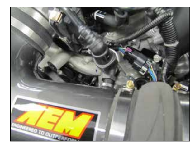
22. Connect the factory crank case vent line to the quick connect fitting installed into the AEM® intake tube.