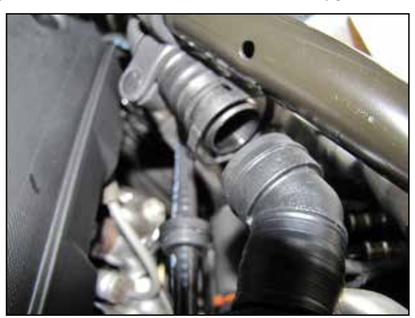
9. Disconnect the sound tube quick disconnect and then remove the complete sound tube assembly.