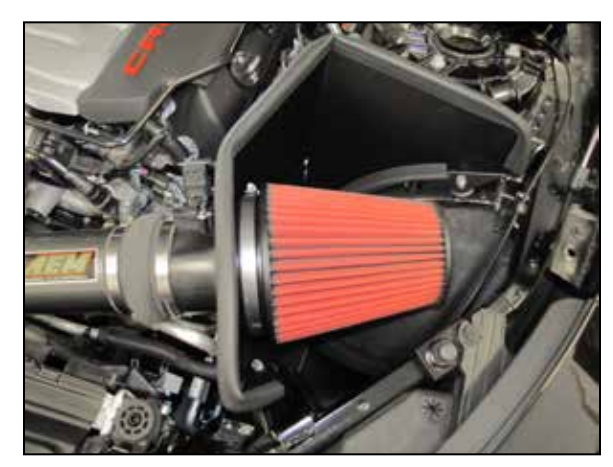
24. Install the AEM® air filter and secure with the provided hose clamp.