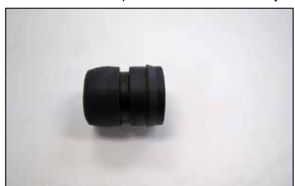
10. Assemble the provided quick disconnect fitting and cap plug.