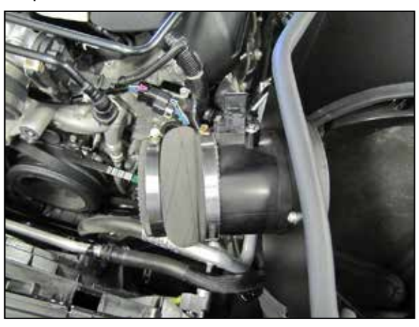
19. Install the provided hump coupler (08633) onto the mass air sensor housing and secure with the provided hose clamps.