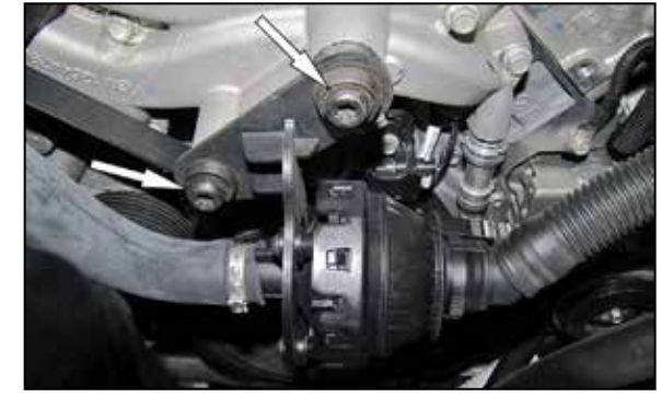
6. Remove the two bolts that secure the sound drum to the engine.