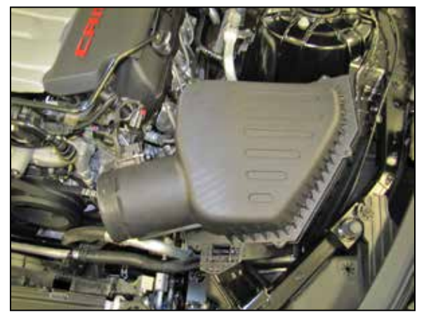
12. Remove the factory air filter housing from the vehicle.

NOTE: AEM recommends that customers do not discard factory air intake.