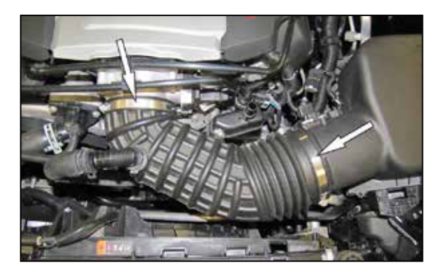
5. Loosen the hose clamps that secure the factory intake tube and then remove the intake tube from the vehicle.