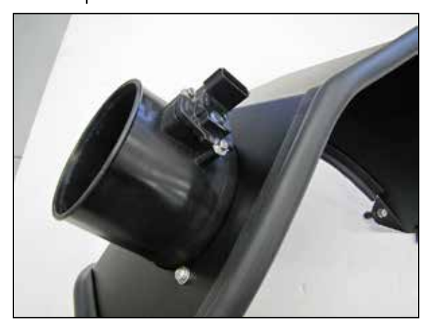
16. Remove the mass air sensor from the factory air filter housing and install it into the AEM® air filter housing using the provided hardware.