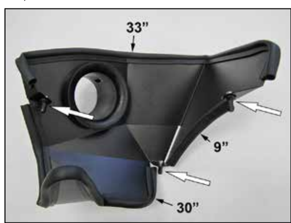
15. Install the edge trim onto the heat shield. Install the three provided mounting studs using the hardware provided.