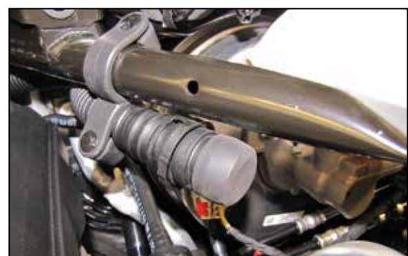
11. Install the cap plug assembly into the remaining factory sound tube quick connect fitting.