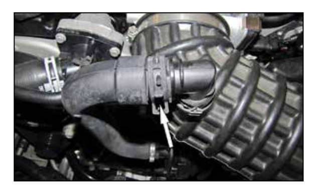
4. Release the spring clamp that secures the sound tube to the intake tube and then disconnect the sound tube.