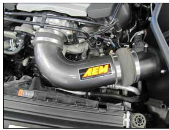
21. Install the AEM® intake tube into the hump coupler and then into the coupler at the throttle body, adjust the tube for best fit and then secure with the provided hose clamps.

NOTE: Plastic NPT fittings are easy to cross thread. Install the vent fitting "hand" tight, then turn it two complete turns with a wrench.