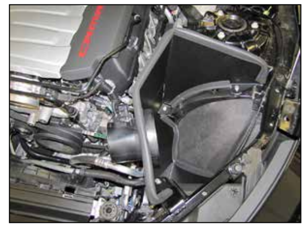
17. Install the heat shield assembly into the vehicle so the mounting studs engage the factory grommets.