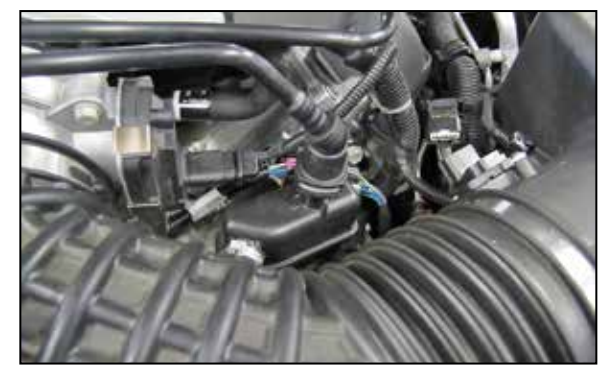
3. Disconnect the crank case vent quick disconnect from the factory intake tube.